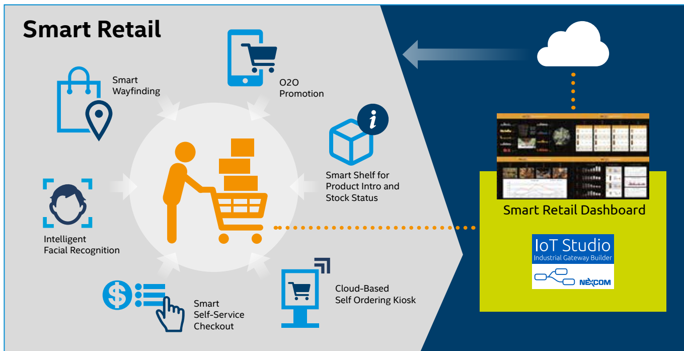
Figure 1. NexStore adopts innovative technologies to create the personalized shopping experience.