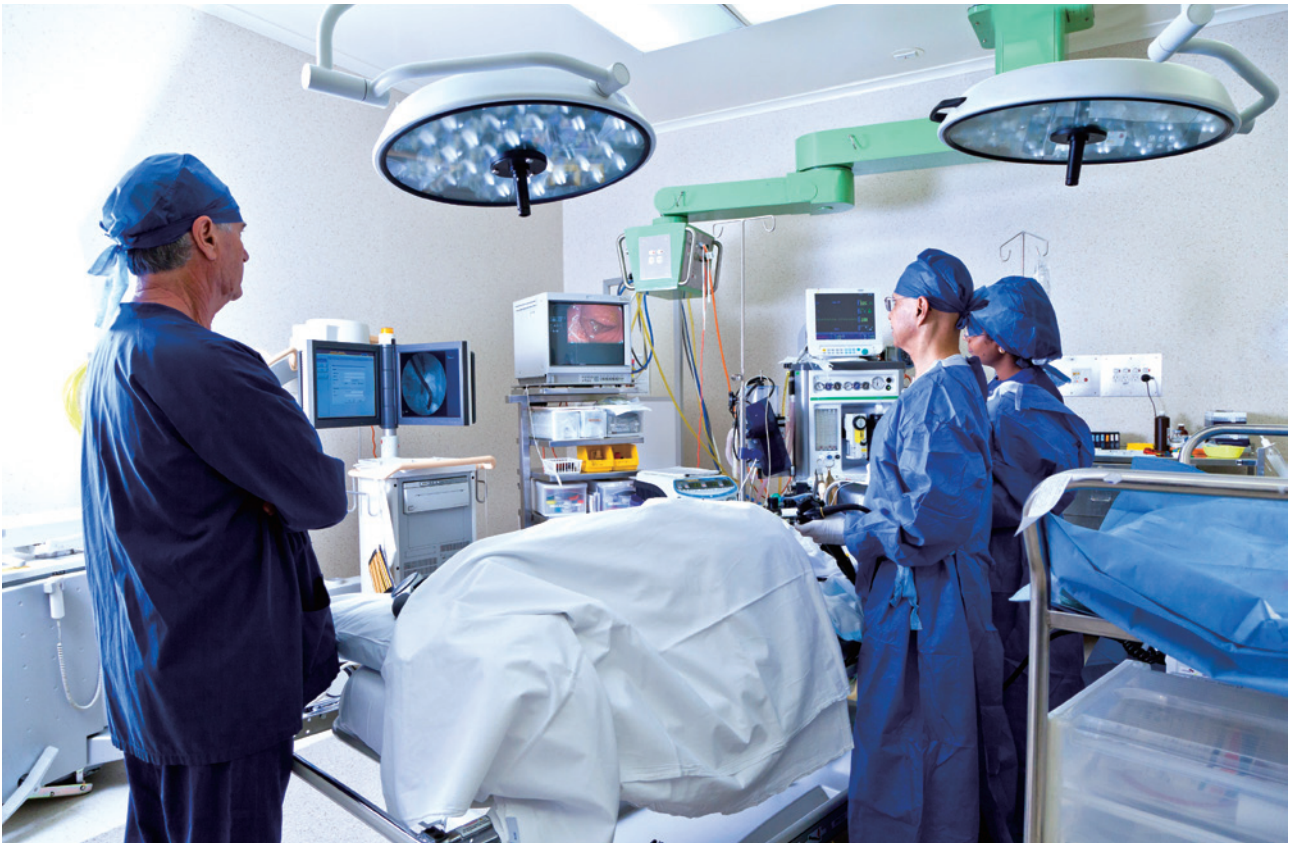
Figure 1. The proliferation of medical equipment creates demand for monitoring and control systems that can centralize and display vital information.

Finally, we show how the 4th generation Intel® Core™ processor family enables all of these capabilities. We examine how these processors provide excellent compute and graphics performance at low power, and how they enhance reliability through hardware-assisted security features.