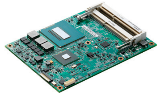
Figure 3. NEXCOM's ICES 670 COM Express Type 6 Module packs server-grade functionality into a chassis half the size of a rack server form factor.

Monitoring and control systems must integrate video, 2D and 3D medical imaging inputs, and data feeds from various equipment, and display the results on one or more high-resolution displays. Squeezing this functionality into a form