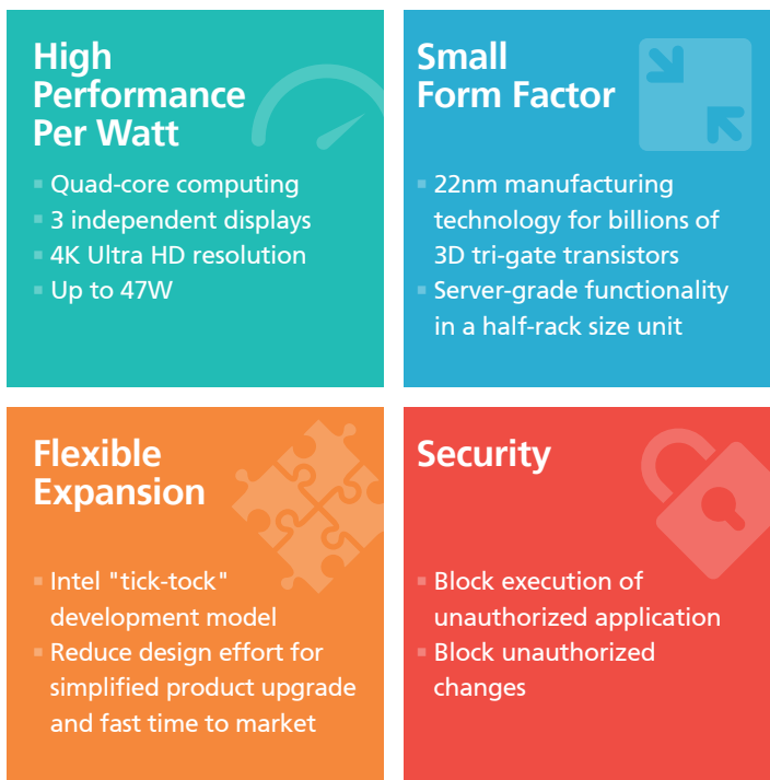
Figure 4. The 4th generation Intel® Core™ i7 processor provides the performance, space savings, security, and upgrade path needed for surgical monitoring and control systems.

ORs. The processors also benefit from the Intel® Advanced Vector Extensions (Intel® AVX) 2.0, an upgraded vector processing technology that effectively doubles the peak floating-point throughput in comparison with the previous generation. The result is improved analysis of medical imaging and other incoming signals.