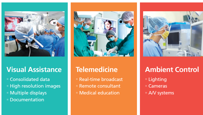
Figure 2. A surgical monitoring and control system has multiple roles and functions in an operating room (OR).

The growing number and complexity of these devices is forcing surgical staffs to spend more of their valuable time and energy interacting individually with each device, distracting the staff from the fundamentals of the operation. As a result, hospitals are seeking surgical monitoring and control system that centralize OR device interfaces. These emerging systems consolidate functions ranging from visual assistance and procedure documentation to ambient control (Figure 2). Surgical monitoring and control systems can also simplify the sharing of real-time video for telemedicine and teaching.